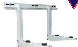
SERENE 2 WALL SPLIT UNIT